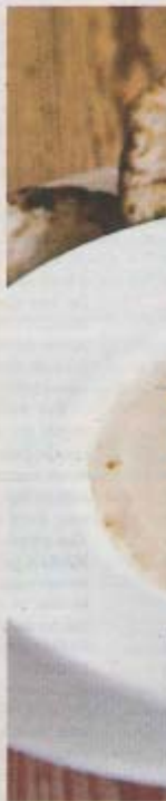
FARM EGG IN CELERY CREAM at MILLER UNION Who knew we were so nostalgic for that soft egg and toast combination we all ate as kids? This dish evokes childhood, but has a decidedly mature slant. Celery is turned silken by blending it into cream, and then a single egg is baked into the mixture. Spread on grilled bread it whispers subtle decadence. $9. 999 Brady Ave. 678-733-8550. www.millerunion.com

DOLMEH at SUFI'S It's the pomegranate that makes this dish — a shock of sweet/tart that permeates the piping-hot rice, split peas and grape leaf wrap. The copious tarragon helps the allure, as does the base of cooling yogurt. But the pomegranate will keep you coming back. $6. 1814 Peachtree St. 404-888-9699. www.sufisatlanta.com