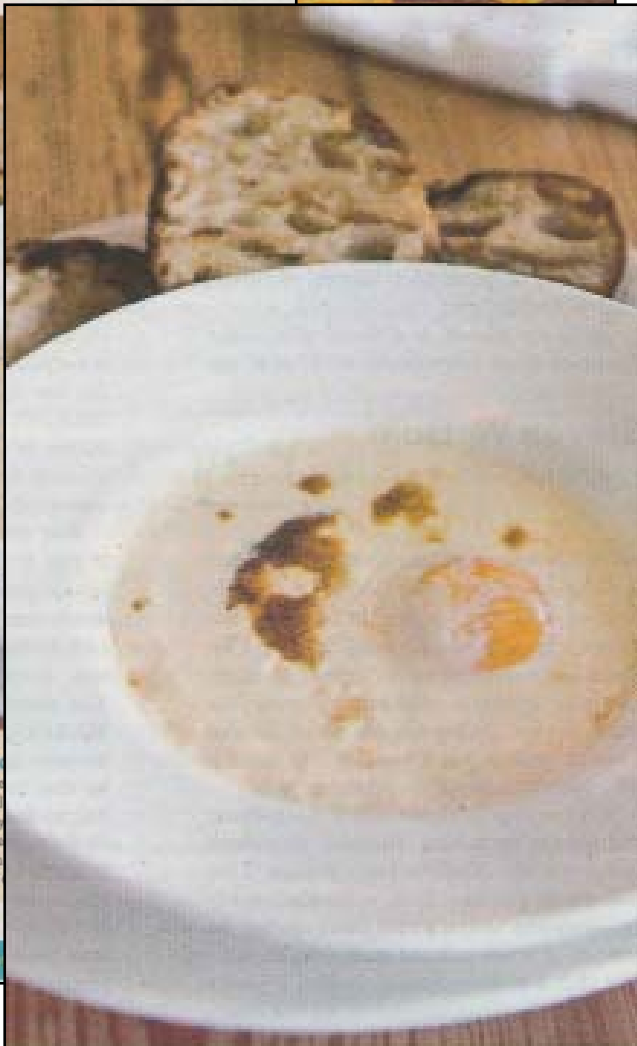
FARM EGG IN CELERY CREAM at MILLER UNION Who knew we were so nostalgic for that soft egg and toast combination we all ate as kids? This dish evokes childhood, but has a decidedly mature slant. Celery is turned silken by blending it into cream, and then a single egg is baked into the mixture. Spread on grilled bread it whispers subtle decadence. $9. 999 Brady Ave. 678-733-8550. www.millerunion.com

SALADS, P. 18 • SOUPS, P. 18 • INTERNATIONAL SNACKS, P. 18 • SANDWICHES, P. 18