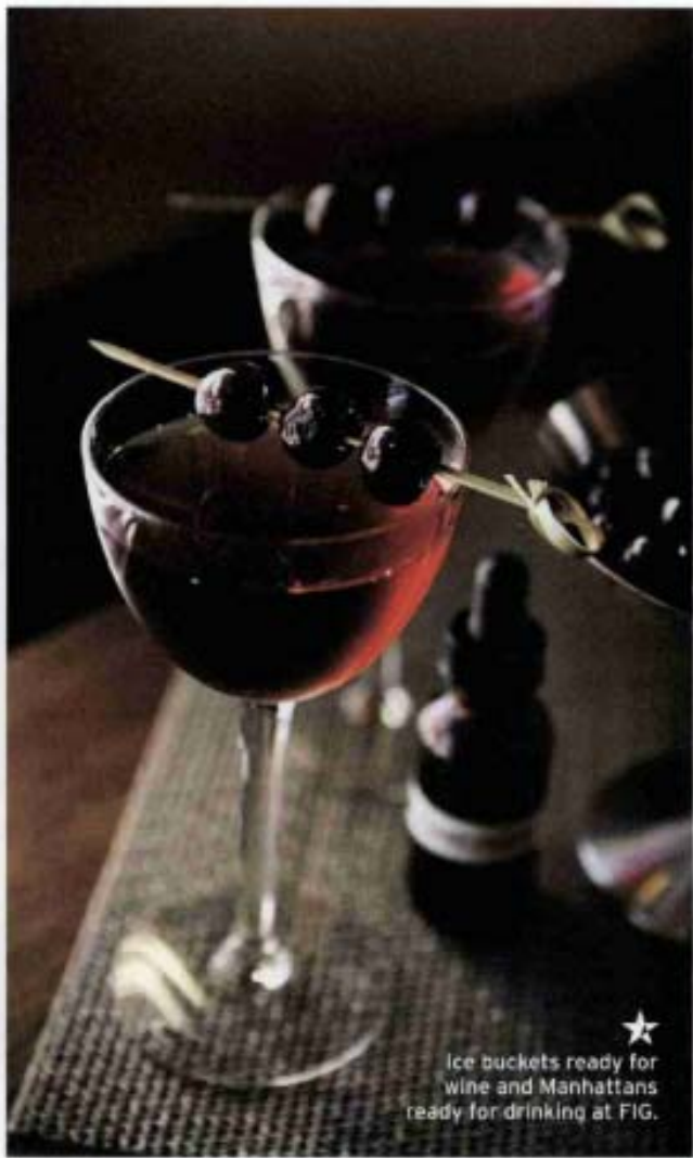
★ Ice buckets ready for wine and Manhattans ready for drinking at FIG.

110 S. Pitt St., Alexandria, VA; 703-706-0450; restauranteve.com